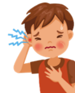
J'ai mal aux oreilles.