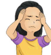
J'ai mal à la tête.