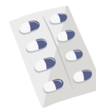
Prenez ce médicament