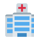
Allez à l'hôpital!