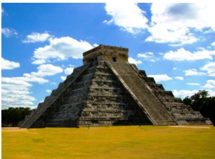
a Maya temple

Religion was important in Maya civilisation and they built many temples. They had writing and number systems using glyphs and three different calendars.