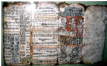
a Maya codex