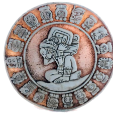
a Maya calendar