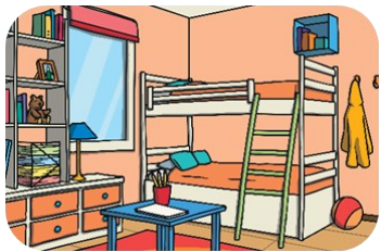
tidying your bedroom

There are lots of different responsibilities —some are good for children and some are for adults . Which do you think are which?