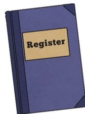
taking the register to the office