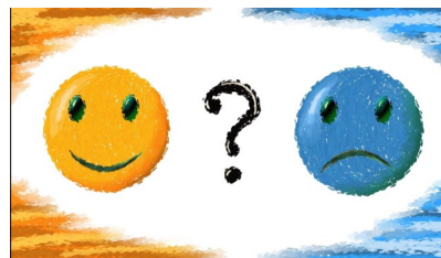
Identify Major or Minor Keys

We will listen to examples of major and minor keys .