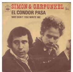
El Condor Pasa

We will listen to this song and make up a piece of music inspired by it.