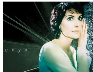
Music by Enya

We will listen to different pieces of music to identify the pitch and listen out for whether it is major or minor and how these things affect the music.