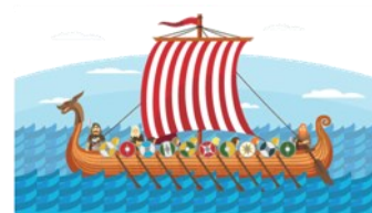
longship for travelling