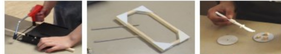
Sawing wood, example chassis and axles, making wheels, finishing off.