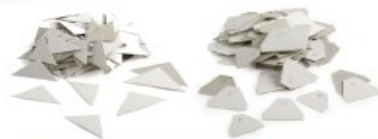
cardboard triangles and hexagons to strengthen the chassis and hold the axle