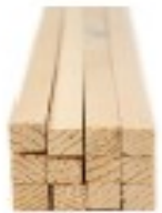
square and round profile dowel for the chassis and axle