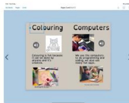
Sessions 5 and 6: Adding more images and finalising