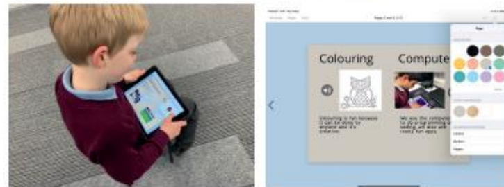
Session 3: Recording commentaries